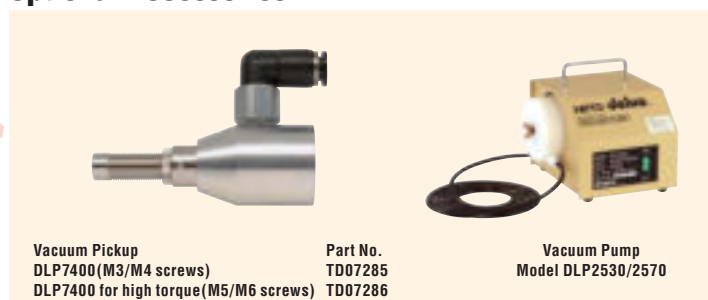
Vacuum Pickup DLP7400(M3/M4 screws) DLP7400 for high torque(M5/M6 screws)