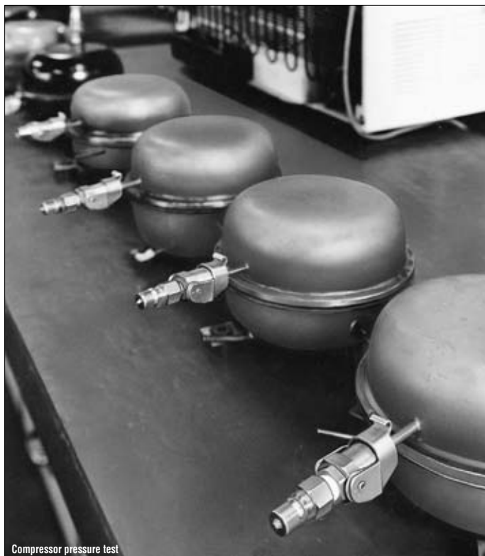
Compressor pressure test

Before use, please be sure to read "Safety Guide" described at the end of this book and "Instruction Sheet" that comes with the products.