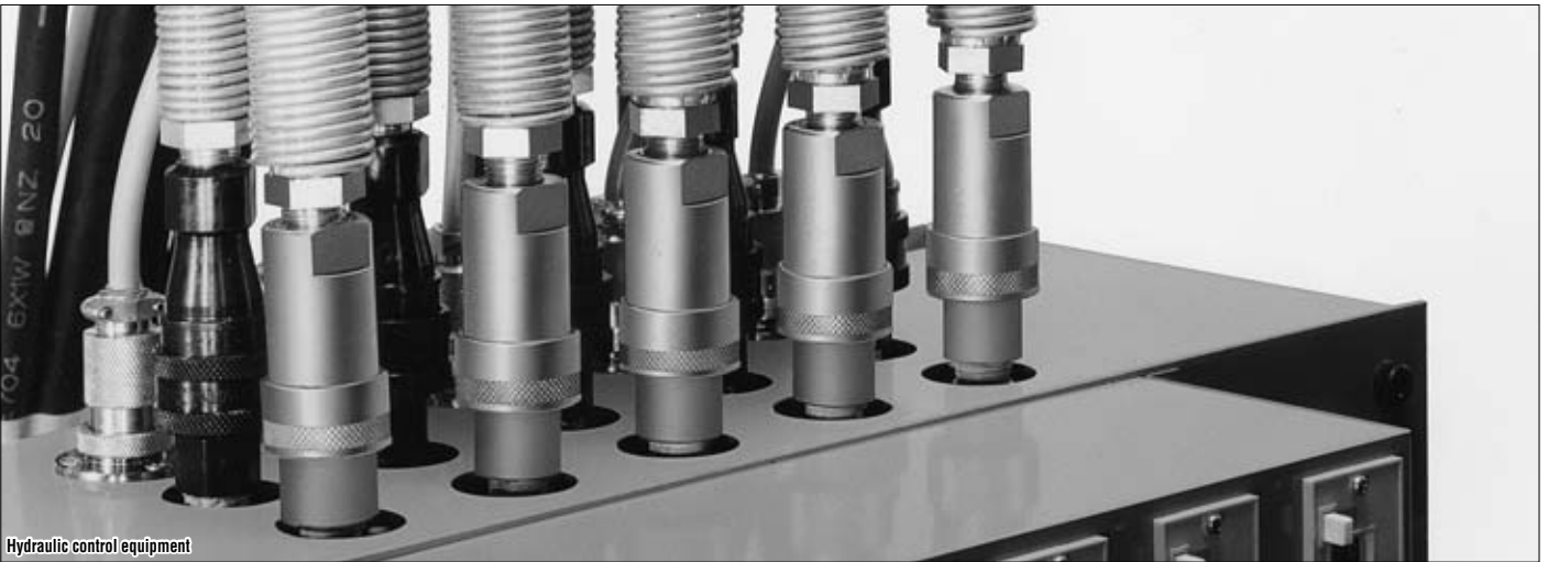
Hydraulic control equipment