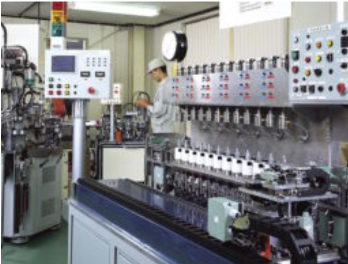
Automatic Cupla inspection system