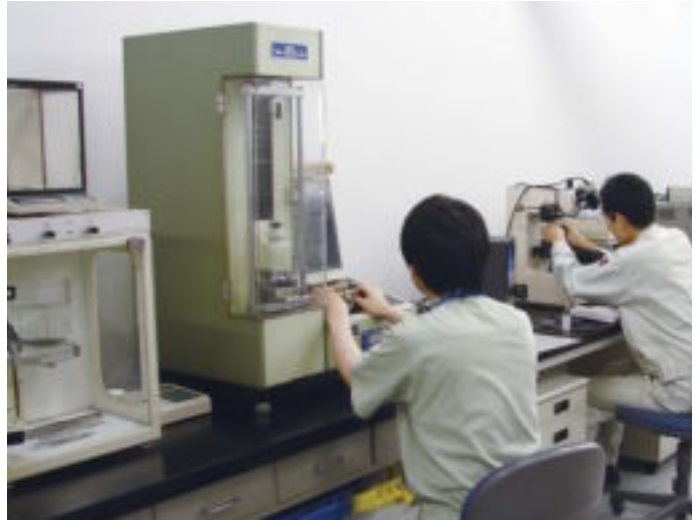
Inspection and measurement with various testing devices