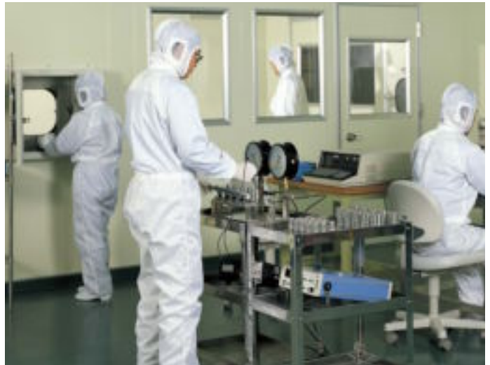
Inspection in clean room