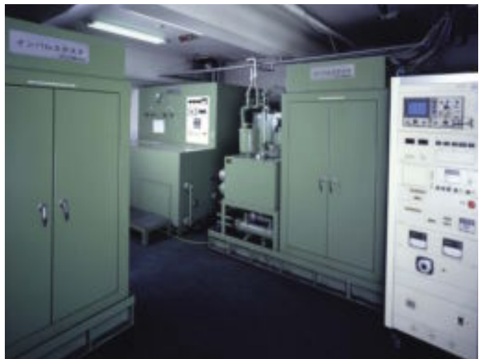
Hydraulic impact tester