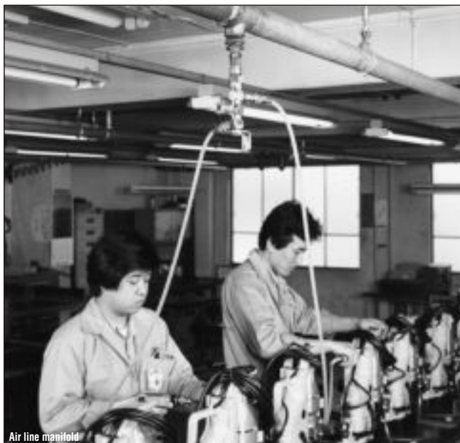
Air line manifold

Before use, please be sure to read "Safety Guide" described at the end of this book and "Instruction Sheet" that comes with the products.