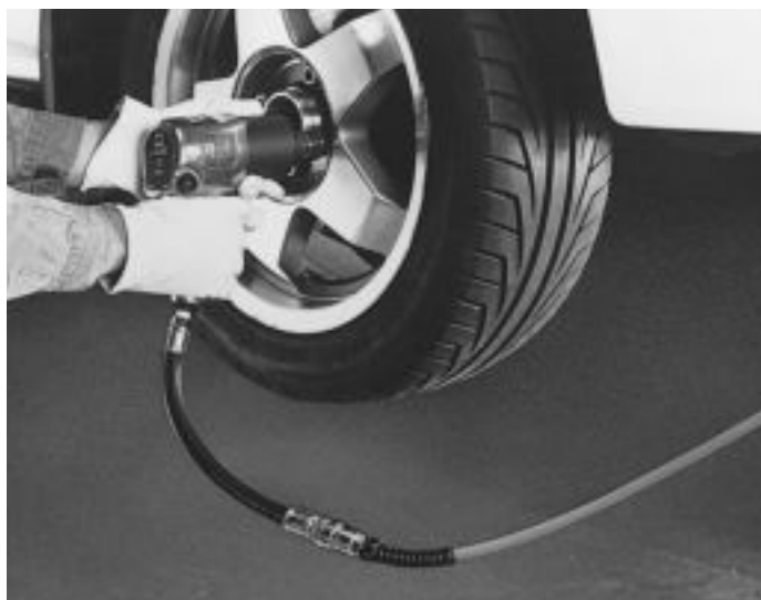
SHA-3-3R R 3/8 male thread type