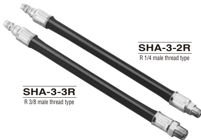
SHA-3-2R R 1/4 male thread type