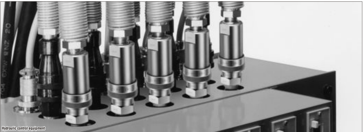
Hydraulic control equipment