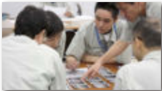
Headquarters and R & D Laboratory