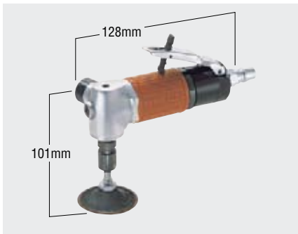
Model MAS-20B Abrasive disc 1", 1-1/2" & 2" OD