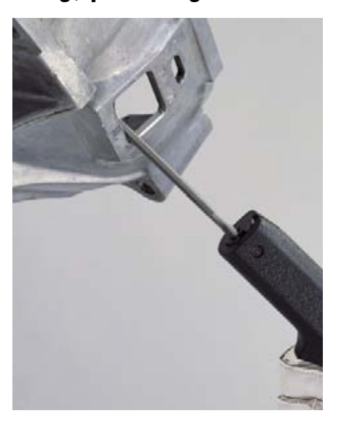
Flat Bastard File SF-13