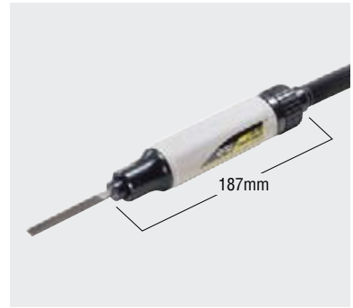
Weight reduced by half for comfortable operation over long period of time