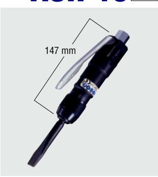
Model CH-24 C€